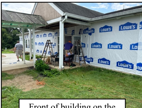
Front of building on the first day with the protective layer installed