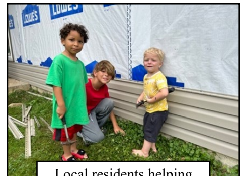
Local residents helping with installation of the vinyl siding