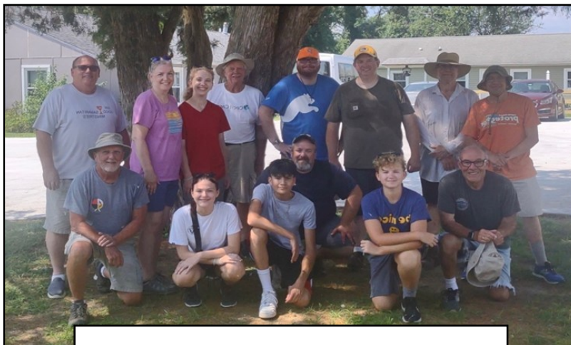
Last day of our team with the Wisconsin Team